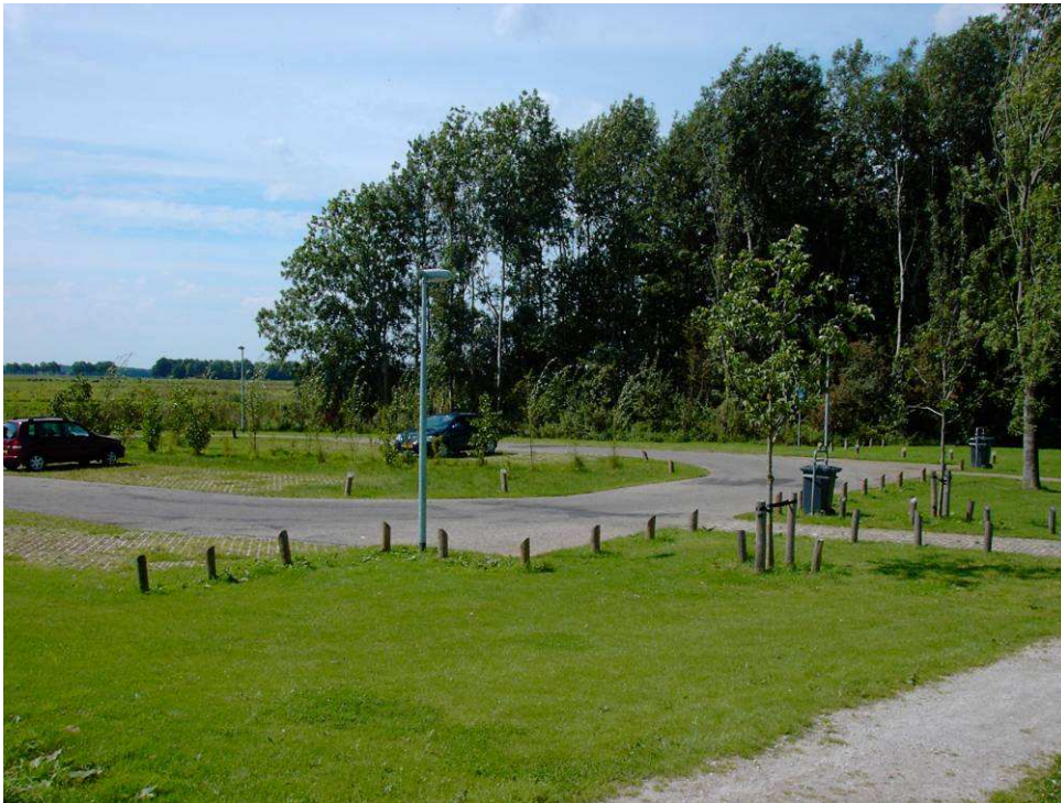
Picture 4- New cycle paths