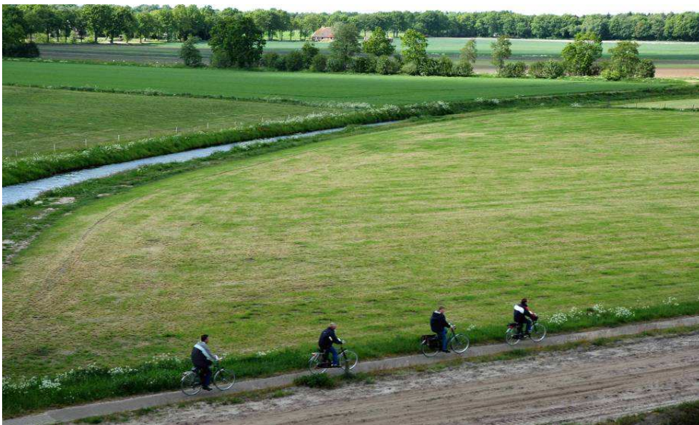
Picture 5- New recreation possibilities